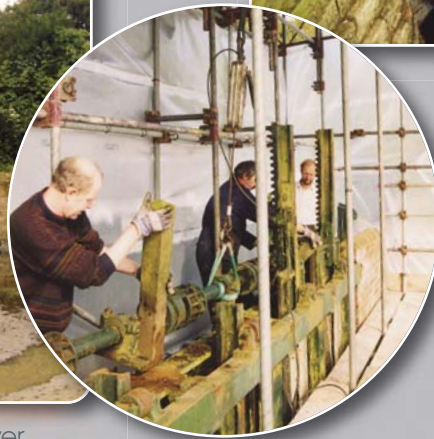
The removal of the top section of the sluice gates including gear components and downright supports.