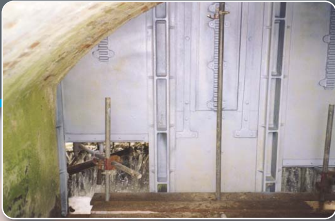
Re-fitted sluice gate section viewed from inside the bridge.

Re-fitted gearing, main-shaft and bearings. Note: the gates have been manually opened to a height of 5 meters with the aid of the newly fitted gear ratios.