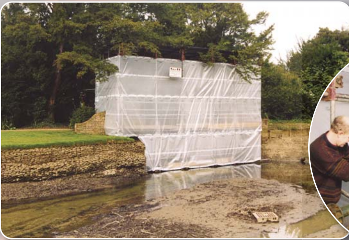
Scaffolding and weather-proofing were erected over the site to comply with health and safety regulations.