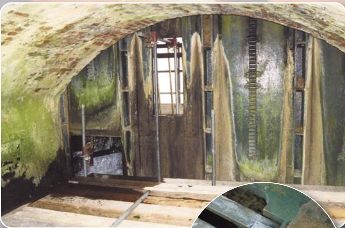
The underside of the bridge showing the scaffolding in place ready for the removal of the sluice gate mechanism. A poorly executed third-party arc weld showing extensive cracking.