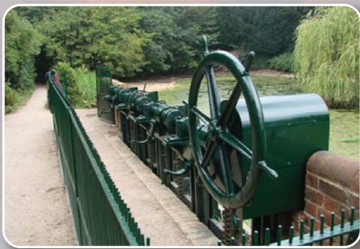
Completed sluice gates with restored mechanism and guards.

The newly finished gates viewed from the river bank opposite.