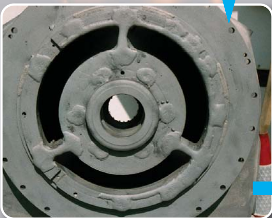
Completed weld and sandblast.