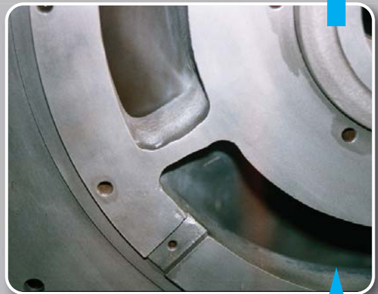
Machining completed the integrity of the weld can be clearly seen.