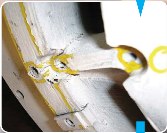
Close up of internal stress fractures.