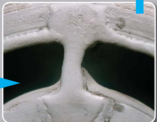
Close-up of weld.